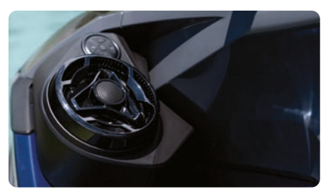
BRP Audio – Premium System (optional) An industry-first manufacturer-installed truly waterproof Bluetooth<sup>†</sup> audio system.

An innovative, industry-first system that allows you to free your pump of weeds and debris with intuitive handlebar-activated controls.