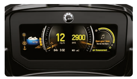
Full-Color 7.8" Wide Display (optional) Full-color display with incredible visibility and a new level of functionality. Bluetooth<sup>1</sup> and smartphone app integration provides music, weather, navigation and more.

An innovative hull that sets the benchmark for rough water handling, stability and offshore performance.