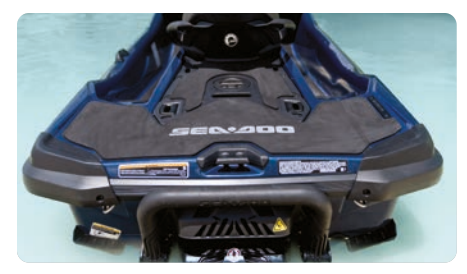
Swim Platform With Integrated LinQ System Exclusive quick-attach system on the largest swim platform in the industry allows for easy