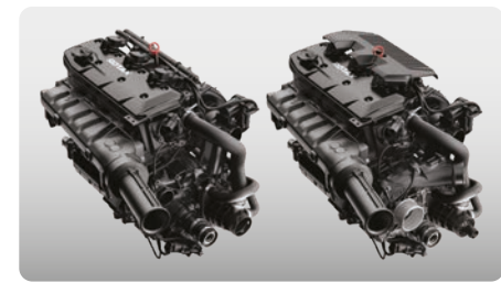
Rotax<sup>®</sup> 1630 ACE<sup>™</sup> - 170/230

The Rotax® 1630 ACE engine block is offered in three configurations on this versatile platform. The 125 kW (170 hp) boasts naturally aspirated punch with optimal fuel economy. 169,16 kW (230 hp) supercharged version allow you to level up the performance to your liking.