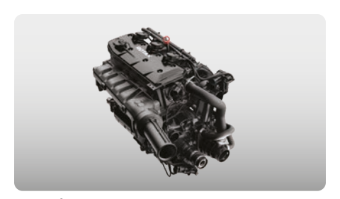
Rotax® 1630 ACE™ – 130 Engine The powerful and reliable naturally aspirated 1630 ACE™ – 130 is all about fun and acceleration while providing excellent fuel efficiency.