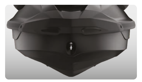
GTI™ Hull This moderate V-shaped hull guarantees a stable, enjoyable ride in variable water conditions. Confident, predictable handling but incredibly playful when you want it to be.