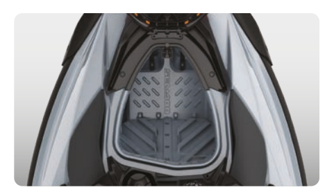
Large Front Storage An impressive 144 liters of sealed storage space allows riders to safely stow belongings while riding.

©2023 Bombardier Recreational Products Inc., (BRP). All rights reserved. ®, TM and the BRP logo are trademarks of Bombardier Recreational Products Inc. or its affiliates. All product comparisons, industry and market claims refer to new sit-down PWC with 4-stroke engines. Watercraft performance may vary depending on, among other things, general conditions, ambient temperature, altitude, riding ability and rider/passenger weight. Testing of competitive models done under identical conditions. Because of our ongoing commitment to product quality and innovation, BRP reserves the right at any time to discontinue or change specifications, price, design, features, models, or equipment without incurring any obligation. †Garmin is a trademark of Garmin Ltd. or its subsidiaries.