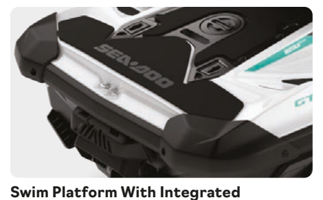
LinQ System Exclusive quick-attach system on a large swim platform that allows for easy installation of accessories.