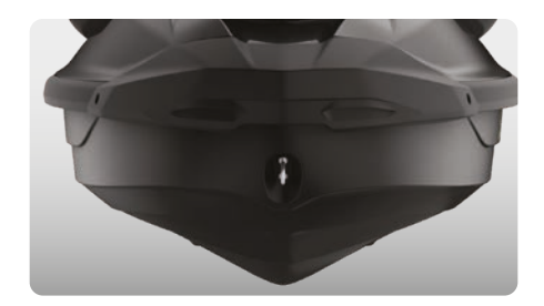
GTI™ Hull This moderate V-shaped hull guarantees a stable, enjoyable ride in variable water conditions. Confident, predictable handling but incredibly playful when you want it to be.