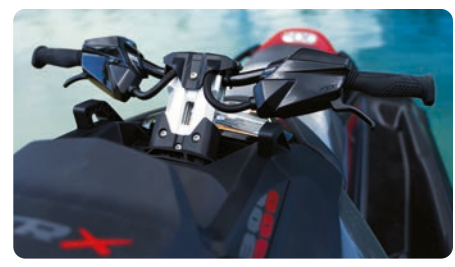
Low-Rise Handlebars Creates a more streamlined, race oriented riding position.