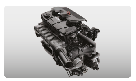
Rotax® 1630 ACE™ - 300 Engine The powerful Rotax® 1630 ACE™ - 300 engine levels up your performance to your liking by delivering high efficiency and a world-class acceleration.