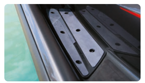
Angled Footwell Wedges Lined with premium carpets, provides superior foot grip.

©2023 Bombardier Recreational Products Inc., (BRP). All rights reserved. ©, TM and the BRP logo are trademarks of Bombardier Recreational Products Inc. or its affiliates. All product comparisons, industry and market claims refer to new sit-down PMC with 4-stroke engines. Watercraft performance may vary depending on, among other things, general conditions, ambient temperature, altitude, riding ability and rider/passenger weight. Testing of competitive models done under identical conditions. Because of our ongoing commitment to product quality and innovation, BRP reserves the right at any time to discontinue or change specifications, price, design, features, models, or equipment without incurring any obligation. †Garmin is a trademark of Garmin Ltd. or its subsidiaries.