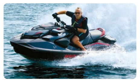
Ergolock™ Two-Piece Racing Seat Tacky surface, back support enhances grip during aggressive riding.