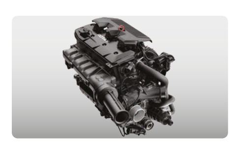
Rotax® 1630 ACE™ – 230 Engine This powerful engine comes standard with a supercharger and external intercooler. It is optimized to run on regular fuel, which lowers fuel costs.¹