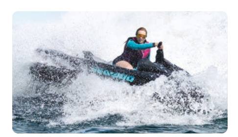
VTS™ (Variable Trim System) Provides handlebar-activated settings so riders can easily find the ideal trim for varying conditions.