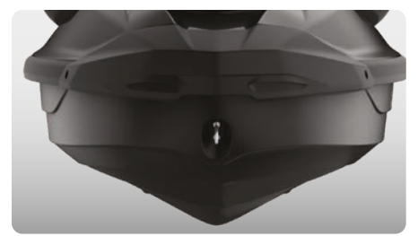
GTI™ Hull This moderate V-shaped hull guarantees a stable, enjoyable ride in variable water conditions. Confident, predictable handling but incredibly playful when you want it to be.